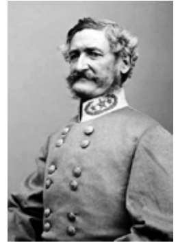
General Henry Sibley

These dreams were short lived. East of Santa Fe, the Union Army clashed again with Sibley's force, this time under the command of Colonel John P. Slough, on the 26th and 28th of March at the battles of Apache Canyon and Glorieta Pass. After destruction of Confederate supply trains by Major John Chivington, Confederate troops were forced to retreat southward never to threaten New Mexico again.