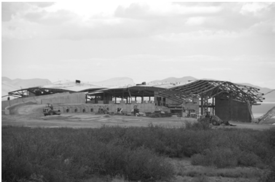
Spaceport America Terminal under construction

Later, Spanish and Anglo-American peoples journeyed through the area, but rarely stayed for very long. Passage through the Jornada del Muerto was considered the most dangerous stretch of the Camino Real del Tierra Adentro , or