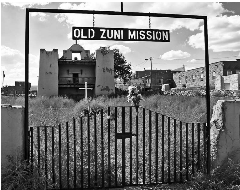
Photo: Old Zuni Mission