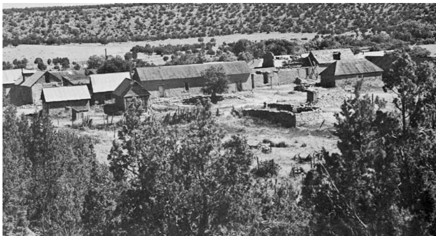
An overview of El Cerrito village by Olen Leonard in 1970

The four main rooms still standing yielded numerous dates that attest to the roofing being replaced in 1875. Beams